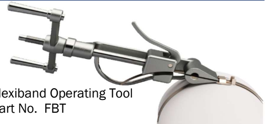
Flexiband Operating Tool Part No. FBT