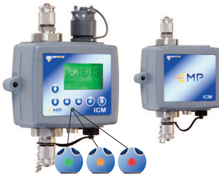
Screen and multicolour indicators