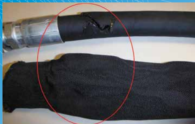
-16 Hose Specimen-4 No Apparent Damage to the Sleeve at the Hose Failure Location

Below: Fluid Power Institute Test - Hose was forced to rupture. BurstGard sleeve withstood the burst and did not tear.