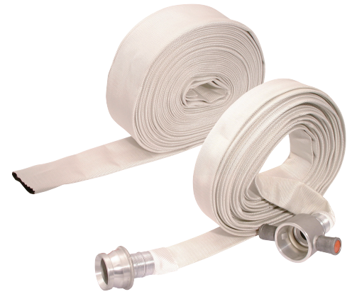
two-component lining system