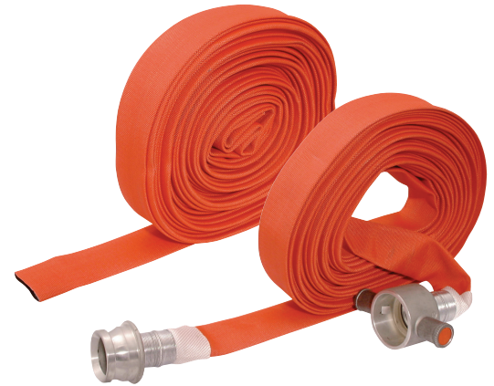
two-component lining system