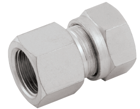
BSPP Female Stud Coupling N.D. Tube