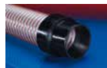
CONNECT 240 + 241